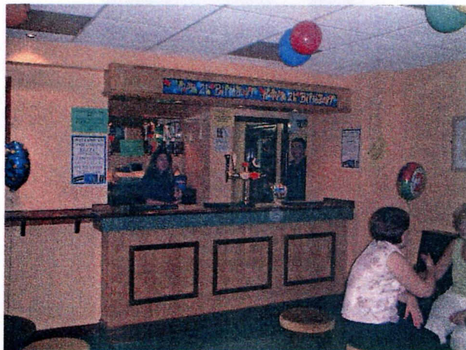
Our Attentive Staff will make sure of fast and efficient service from the well-stocked Bar of Brand-Leading Refreshments.