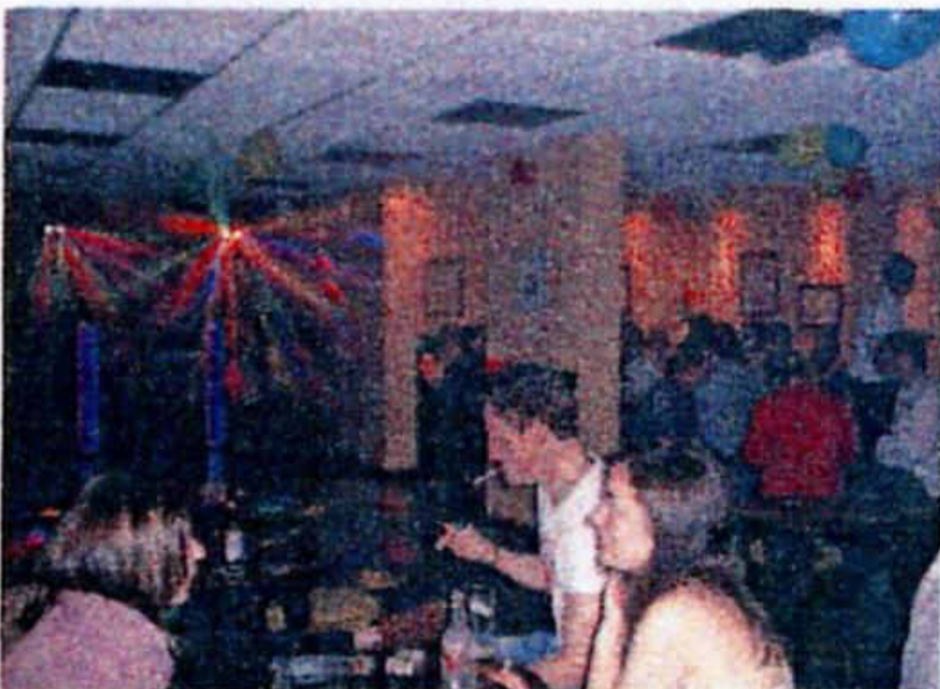
There's also space for your DJ or other Artiste of your choice!

If it's comfort, a welcoming atmosphere and your group is under Eighty guests — The New Carling Suite at Groby Club has to be The Answer!