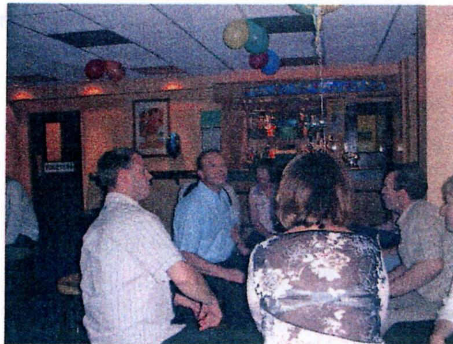
A quiet & friendly chat being enjoyed by all!

The New Carling Suite has everything to offer, with Integral Facilities, right down to the latest Honeywell® Smoke Filtering system — for you and your guest's comfort!